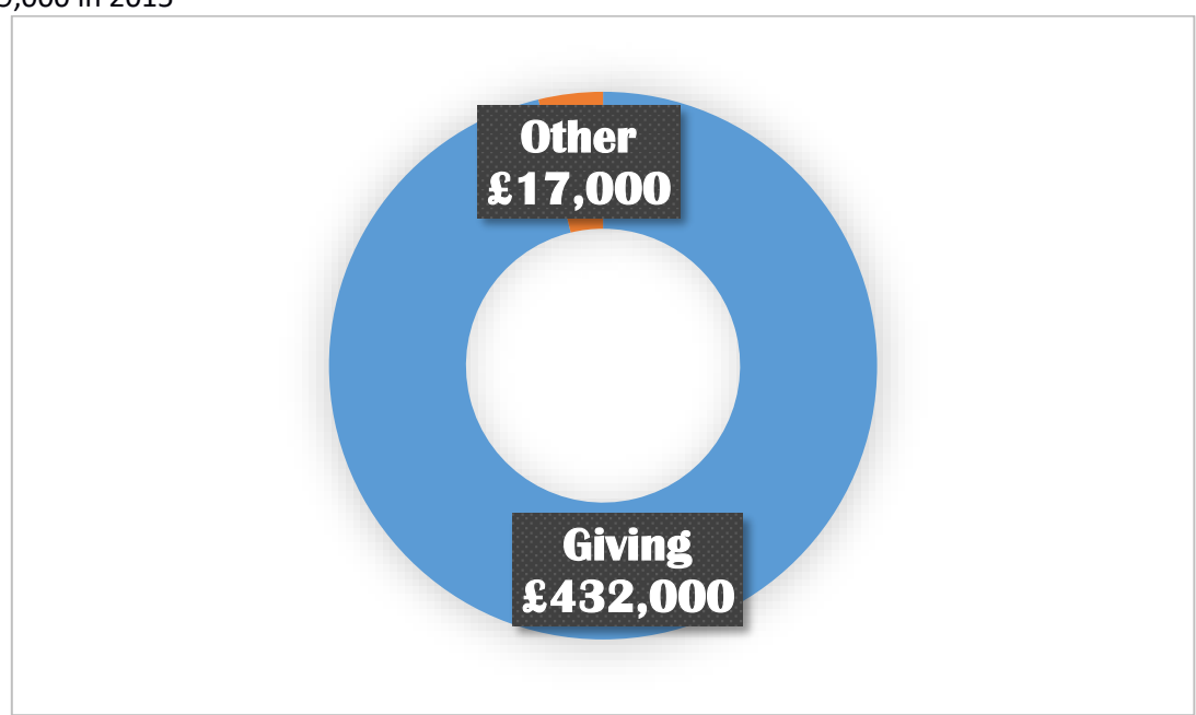
Income £449,000 in 2015

2016: What we plan and pray will happen.